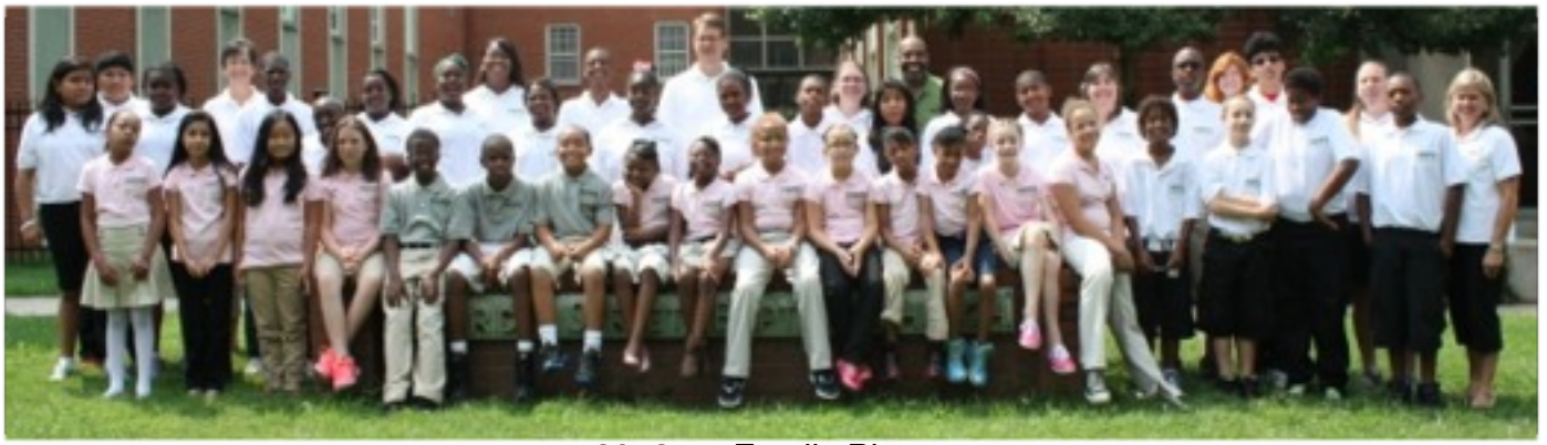
2013-14 Family Photo