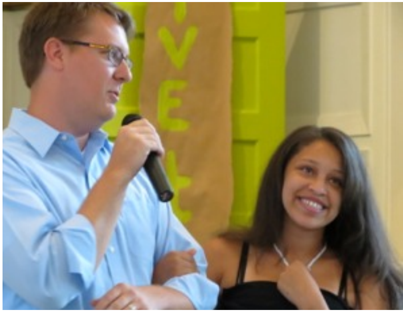
Class of 2013